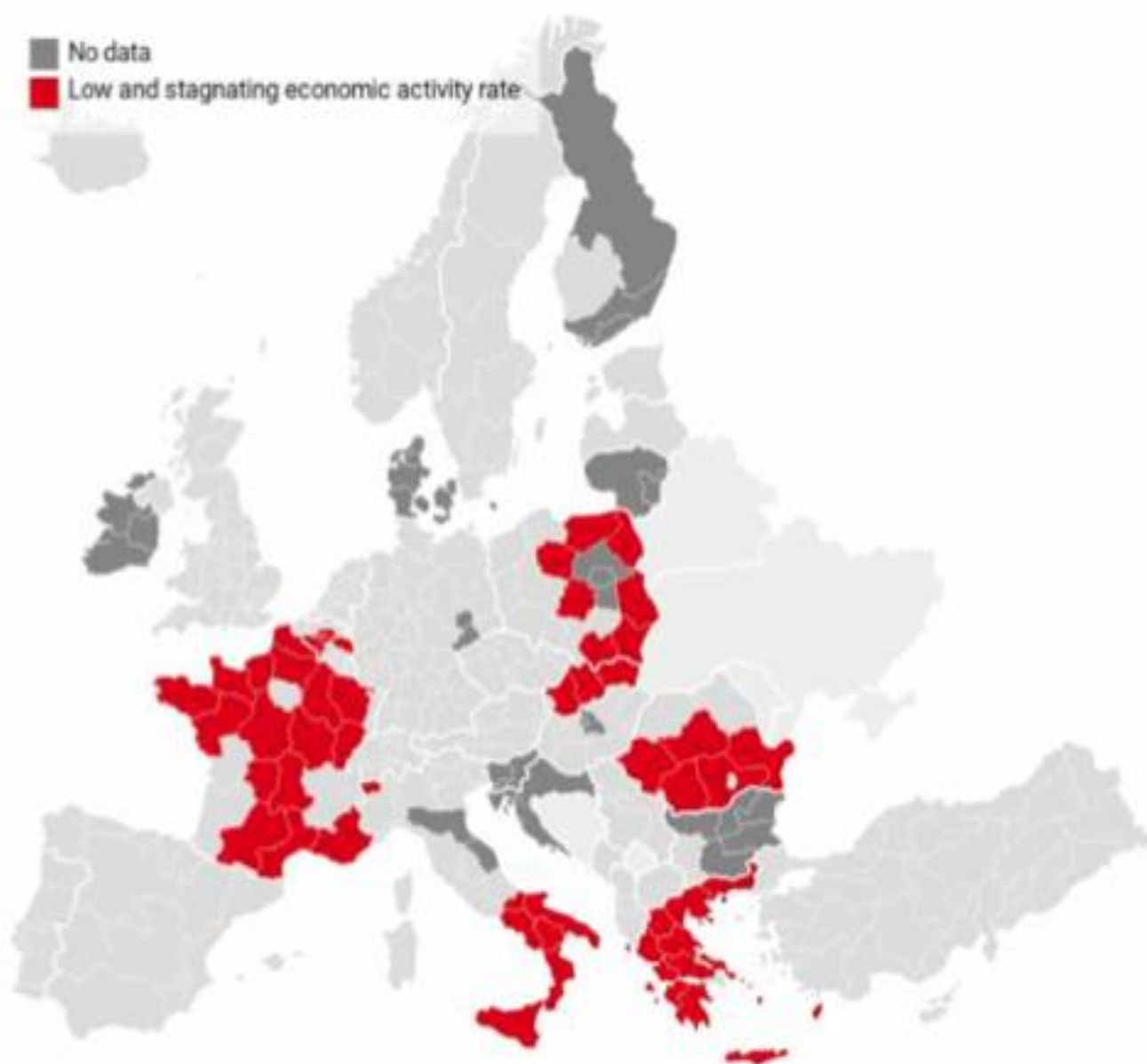
Figure 4. Regions with low and stagnating economic activity rates 5